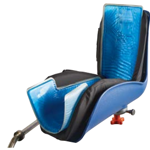
S. Lithotomy Boot Liners

*All products sold individually unless otherwise noted.