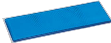
T. Fracture Foot Pads