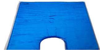
U. Vac Pac Universal Covers