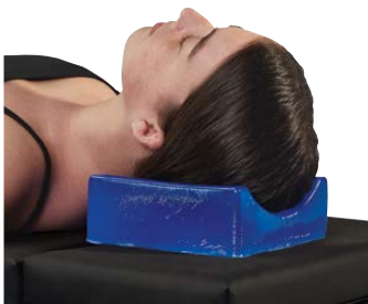
Head and Neck