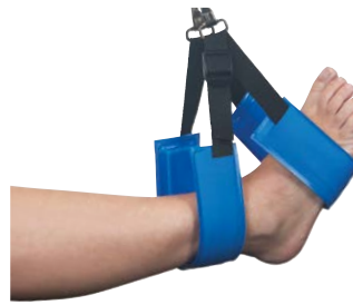
R. Ankle Stirrup Pads