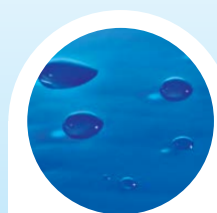
Impervious to fluids